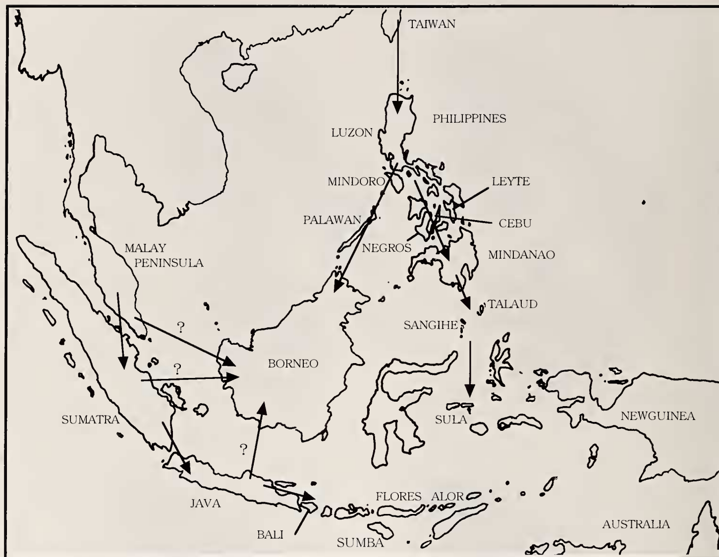
FIG. 5. A map of Southeast Asia, showing islands recently invaded by Papilio demoleus . Arrows indicate presumable direction of the invasion.

Furthermore, P. d. libanius has been also recorded from Talaud, Sangihe and Sula Islands of the Moluccas (Tsukada & Nishiyama 1980, Corbet & Pendlebury 1992), again suggesting invasion via the Philippines (Table 1, Fig. 5).